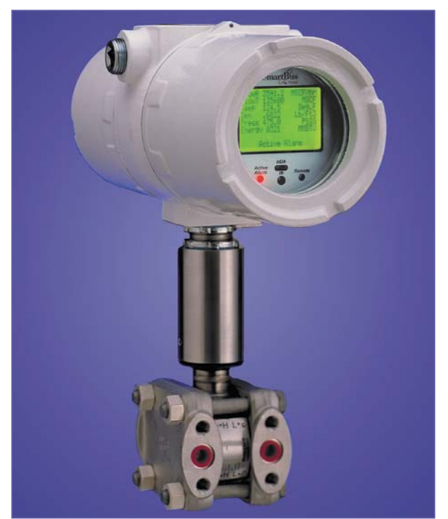
Field mounted flow computer with integrated multivariable sensor.

To cite an example, Transco Gas, UK, upgraded its entire transmission system with over 200 flow computers with the capability to meter any combination of orifice, turbine or ultrasonic meters as well as a direct interface to gas analysers. These multifunction multistream flow computers also operate as their own station controller and database.