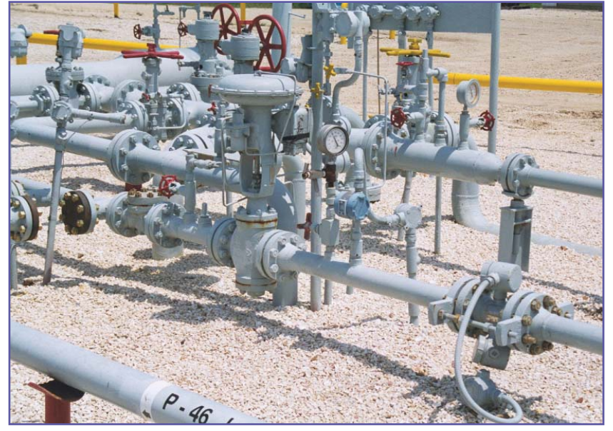
A common meter-run setup.

The standard dealing with electronic flow measurement for gas (API MPMS Chapter 21.1) was published in 1993. The