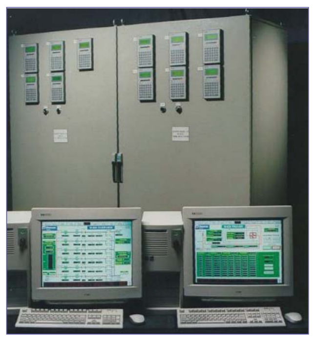
Installation of flow computers communicating to a PLC sysytem within a control room environment.

manufacturers, and the metrological testing and approvals agencies who regulate them, in areas such as measurement integrity.