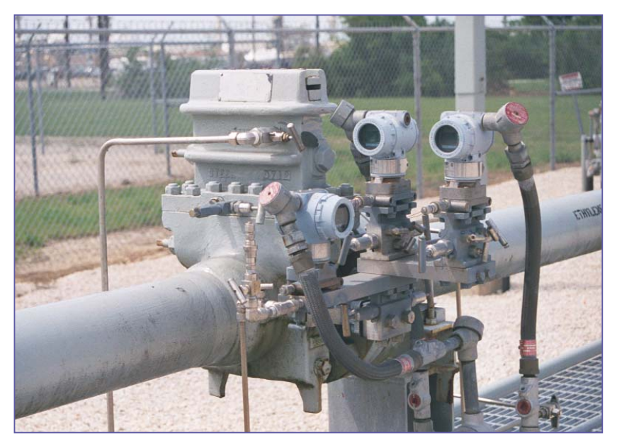
Using a field mounted transmitter as a secondary transducer to the primary flow meter.

and application software. The latter approach is used in the majority of industrial applications, including DCS systems.